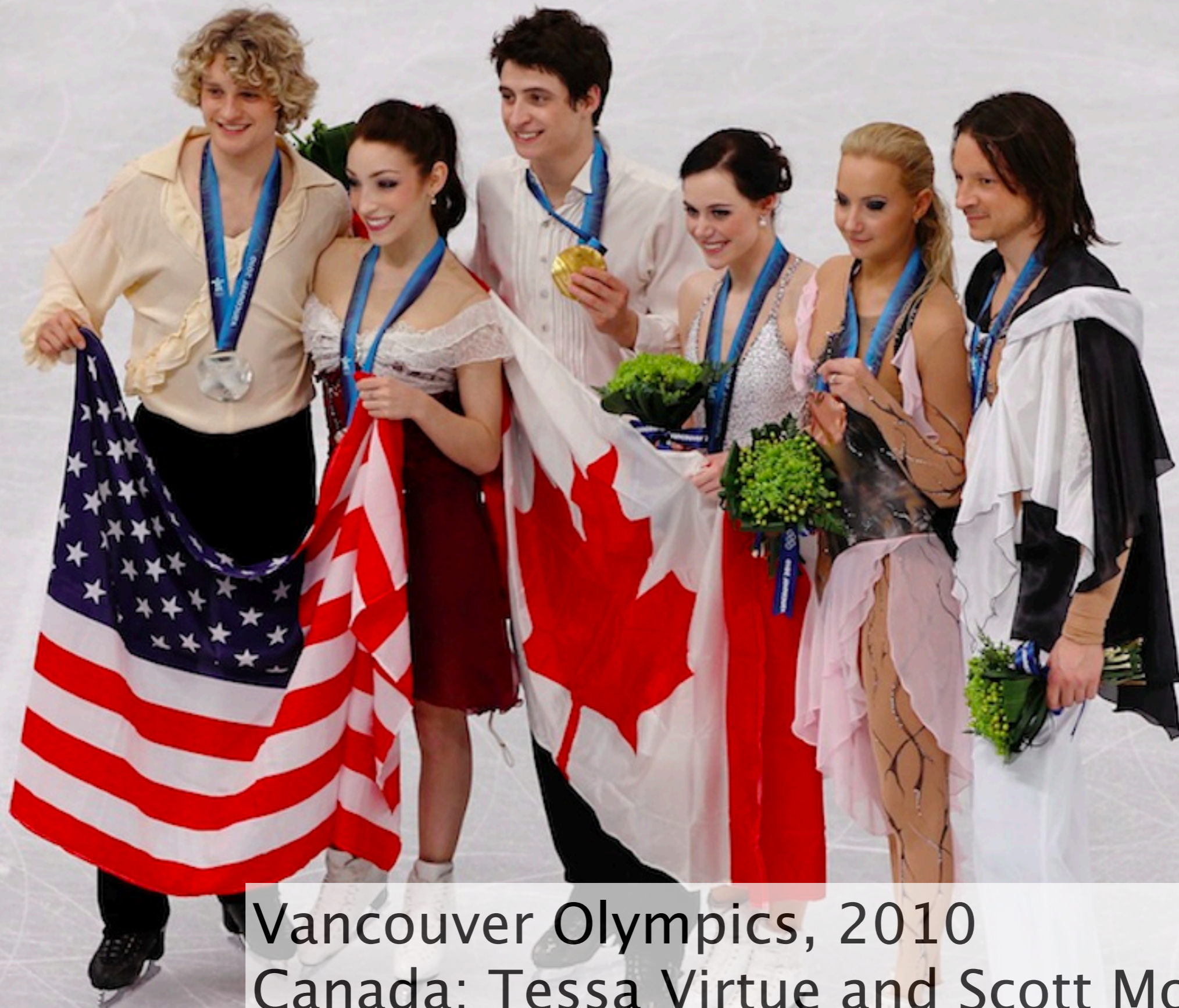
Vancouver Olympics, 2010 Canada: Tessa Virtue and Scott Moir: Gold USA Meryl Davis and Charlie White: Silver