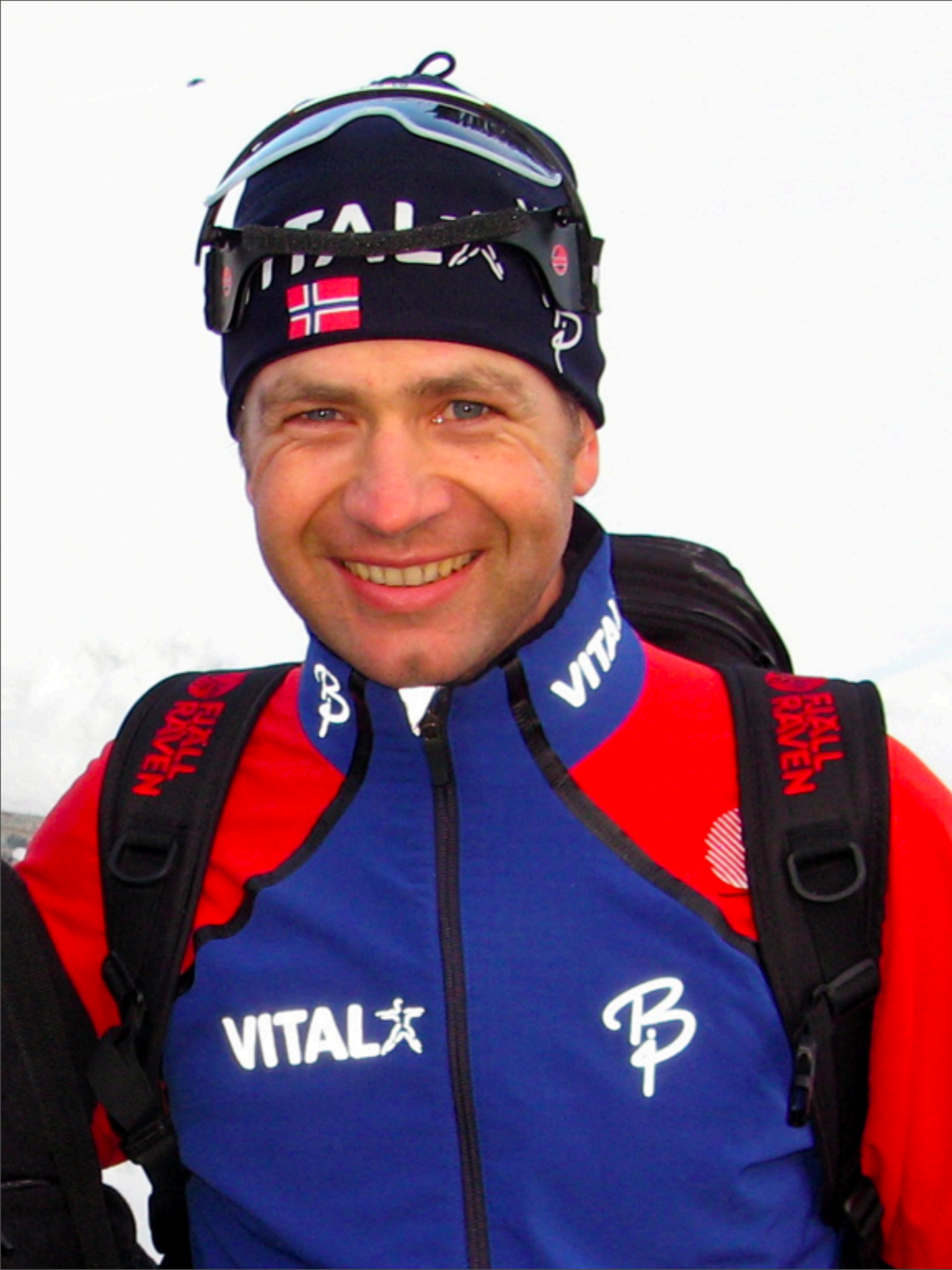
Ole Einar Bjørndalen