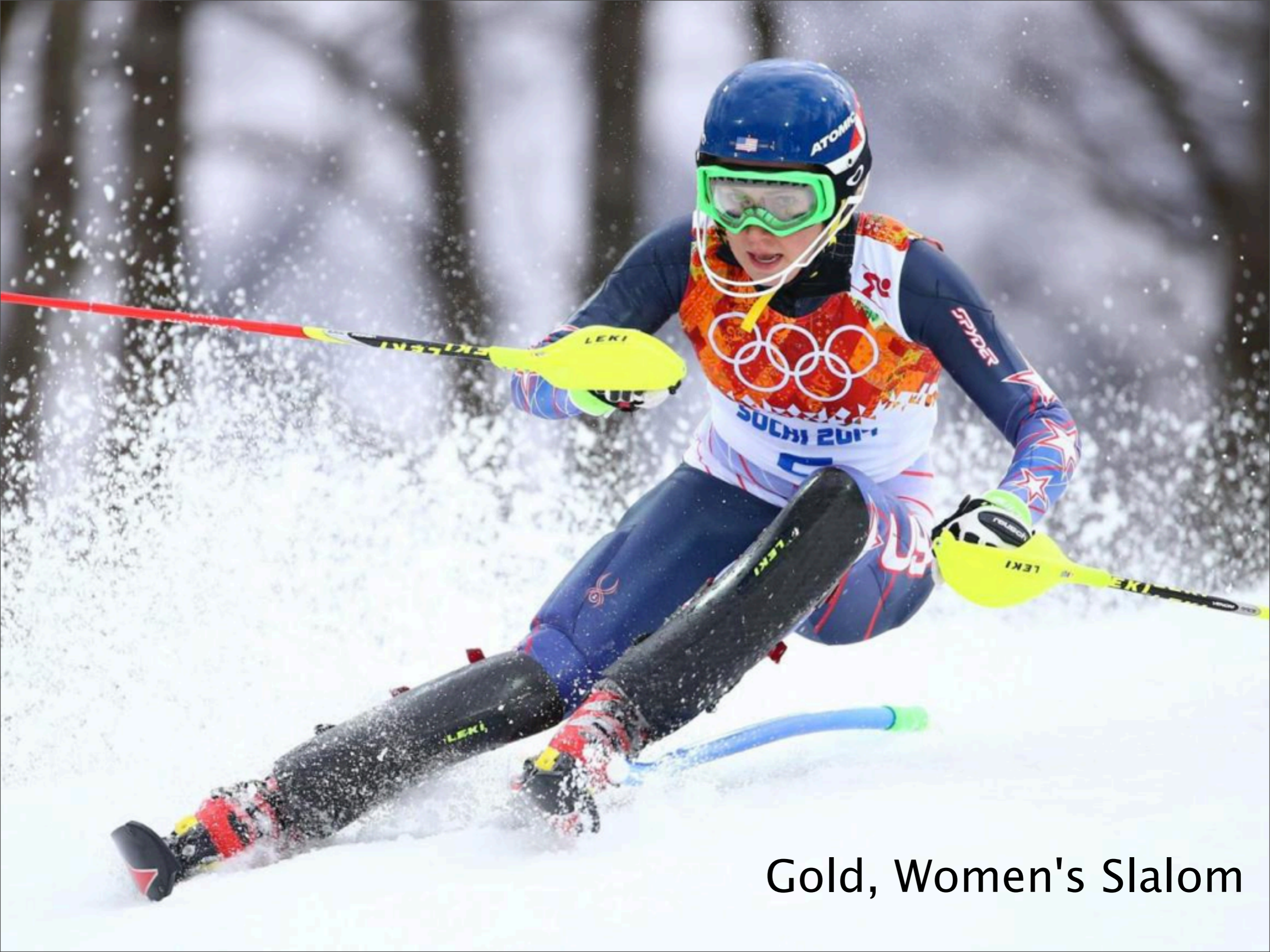
Gold, Women's Slalom