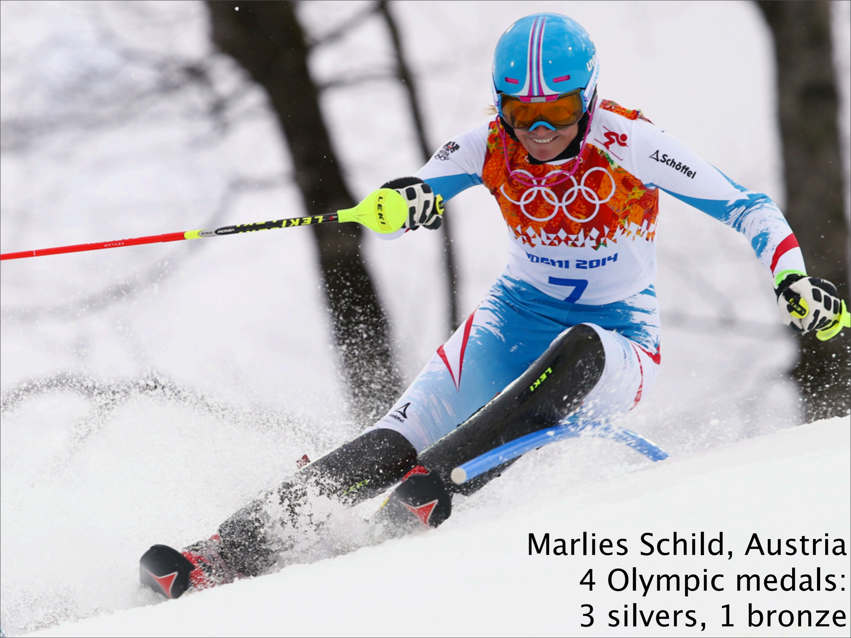
Marlies Schild, Austria 4 Olympic medals: 3 silvers, 1 bronze