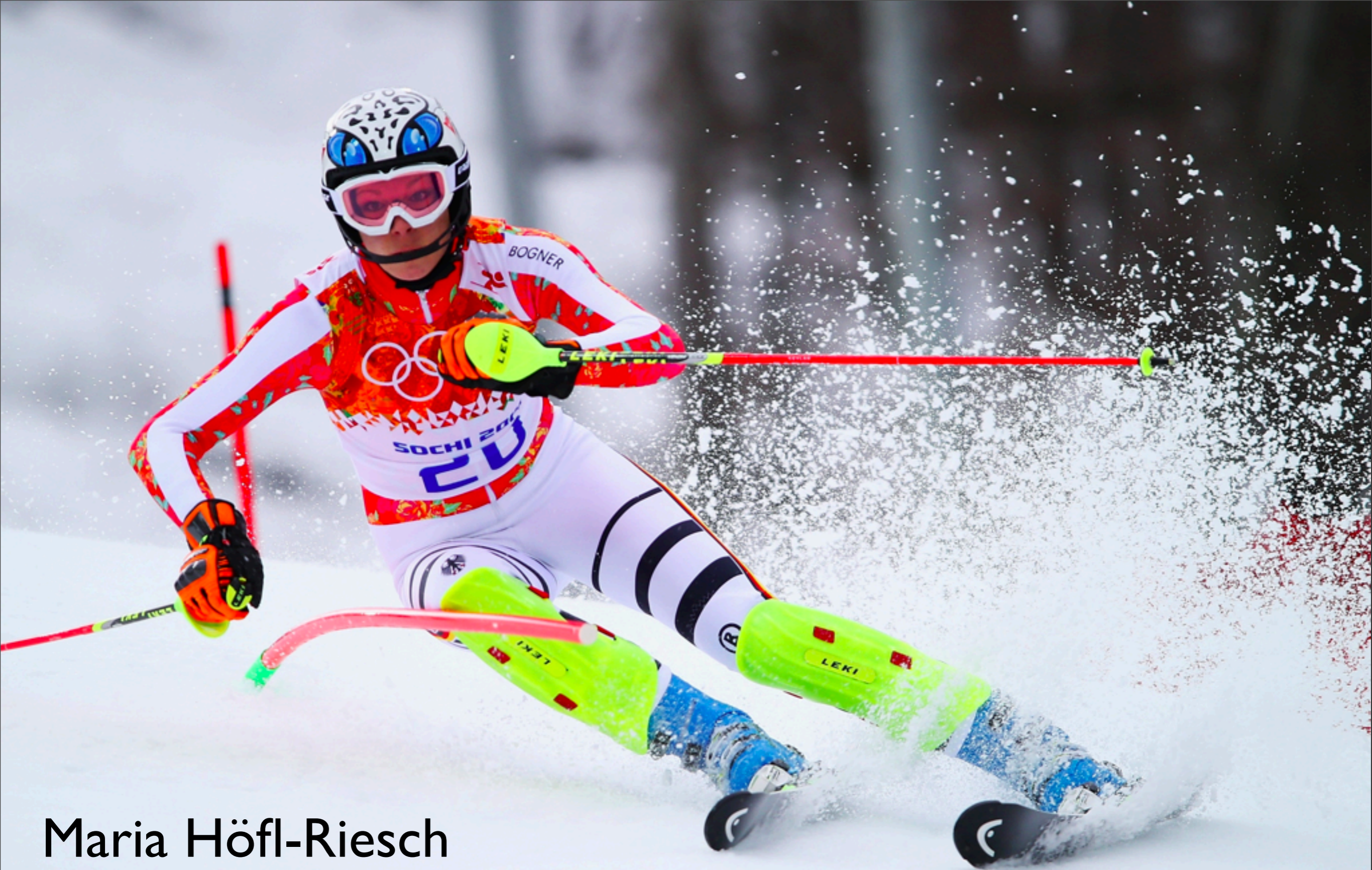
Maria Höfl-Riesch Four Olympic medals: 3 gold, 1 silver