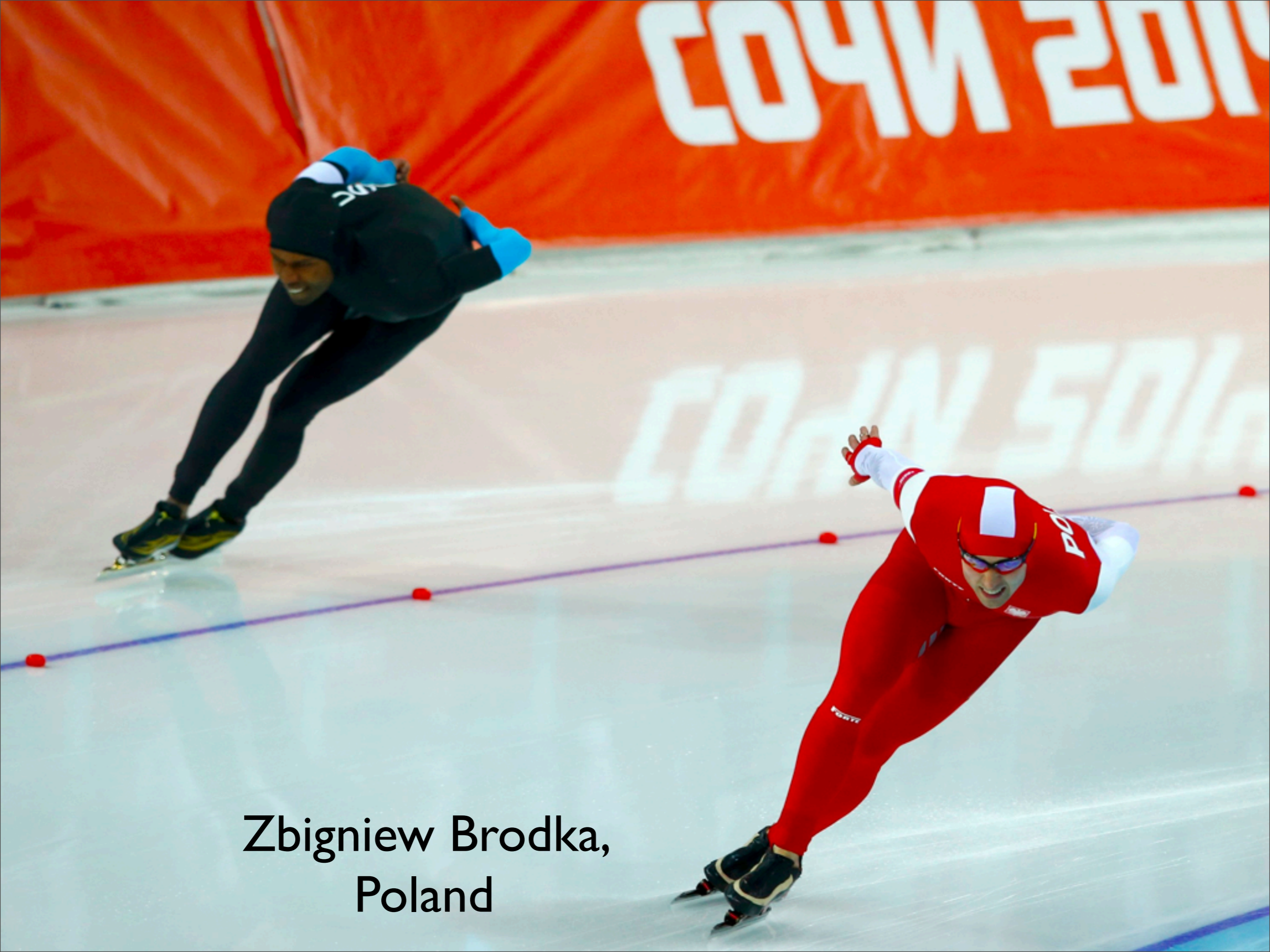
Zbigniew Brodka, Poland